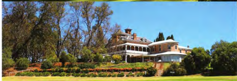
Duntryleague Golf Club & Guest House