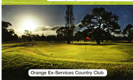
Orange Ex-Services Country Club